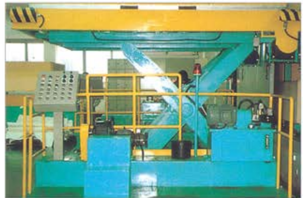
▲ MANUFACTURED AND DELIVERED TO DOOSAN ELECTRONICS