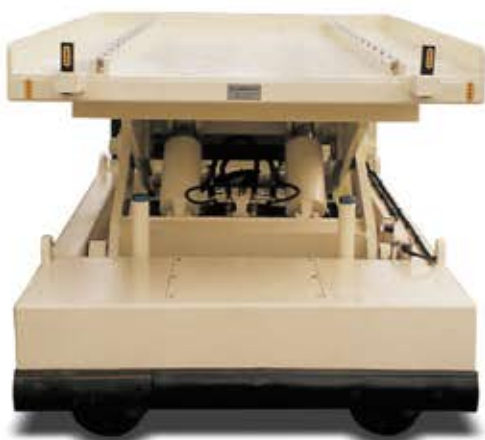
◀ ELECTRIC SCISSOR TRACKLESS TRANSPORTER CAR MANUFACTURED AND DELIVERED TO LG ELECTRONICS