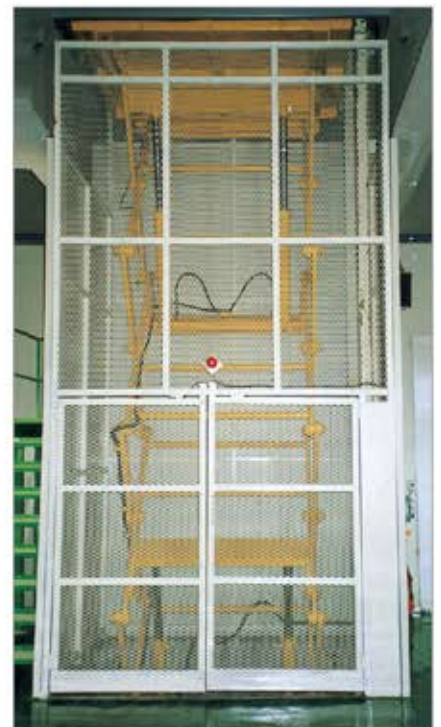
▲ TABLE LIFT TYPE ELEVATOR