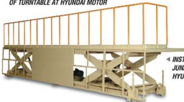
◀ INSTALLATION AT JUNJOO FACTORY OF HYUNDAI MOTOR COMPANY