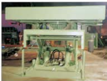
▲ INSTALLATION OF ATTACHED TYPE OF TURNTABLE AT HYUNDAI MOTOR