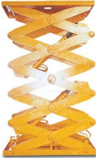
TABLE LIFT - HTL series