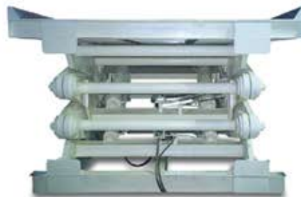
◀ 15 TON & 3 STAGE LINK INSTALLED AT SUNGWO HITECH